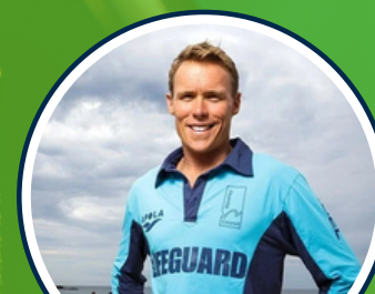
ANDY REID (BONDI RESCUE STAR)