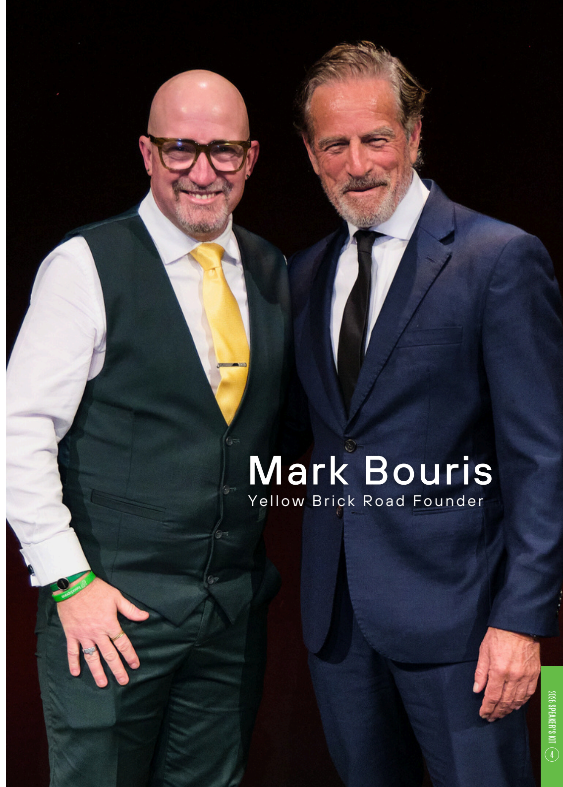
Mark Bouris Yellow Brick Road Founder