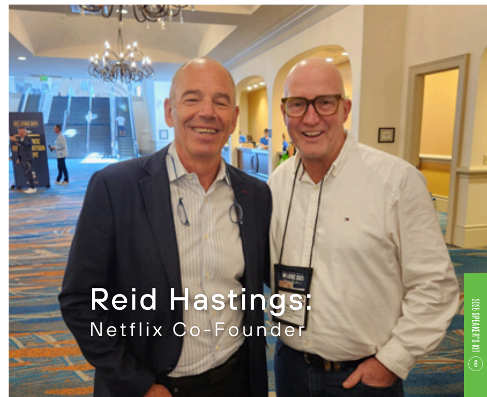
Reid Hastings: Netflix Co-Founder