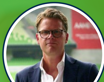
JUSTIN RODSKI (MELBOURNE STORM CEO)