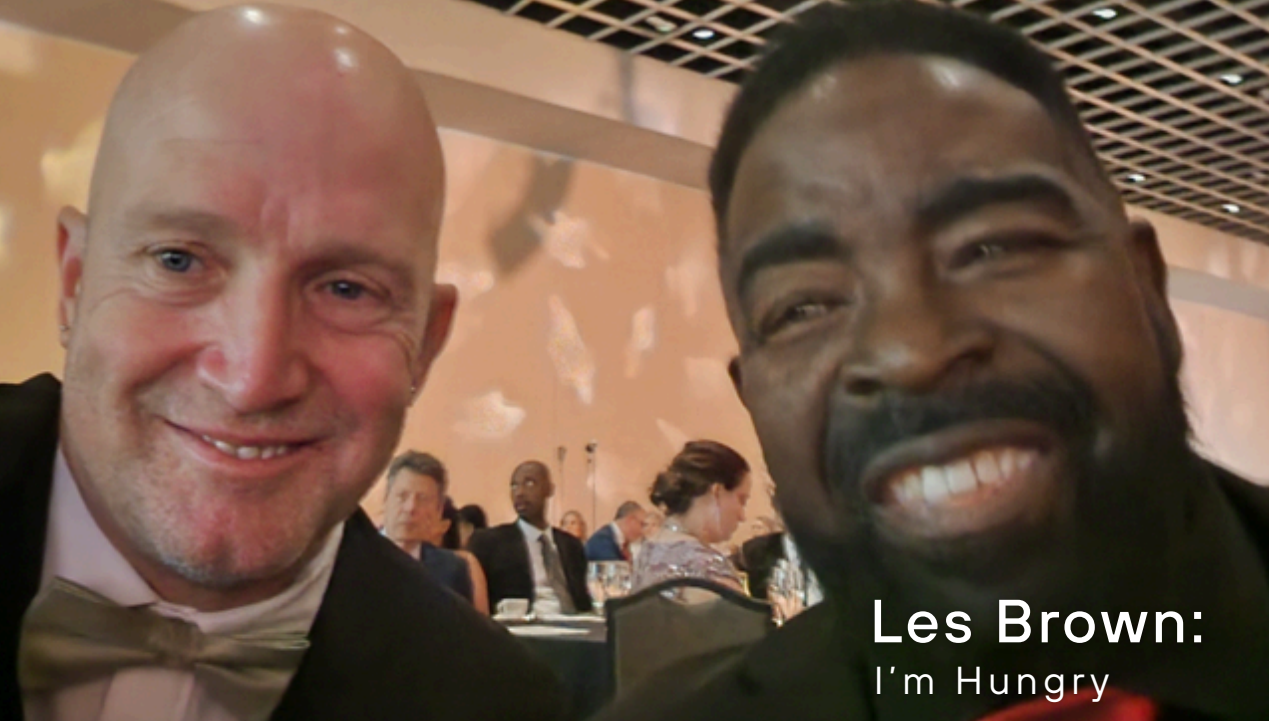
Les Brown: I'm Hungry