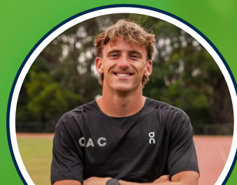
PEYTON CRAIG (OLYMPIAN – FROM GLADSTONE)