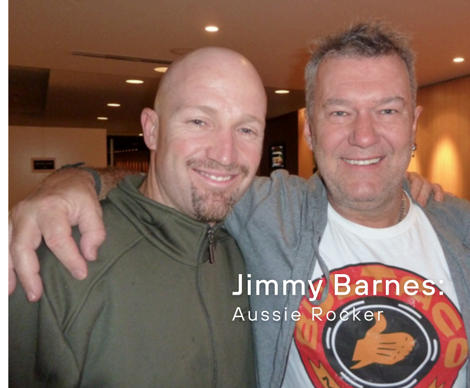
Jimmy Barnes: Aussie Rocker