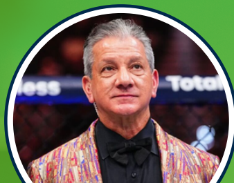
BRUCE BUFFER (VOICE OF THE OCTAGON)