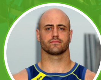
NATHAN SHARPE (AUSTRALIAN RUGBY UNION GREAT)