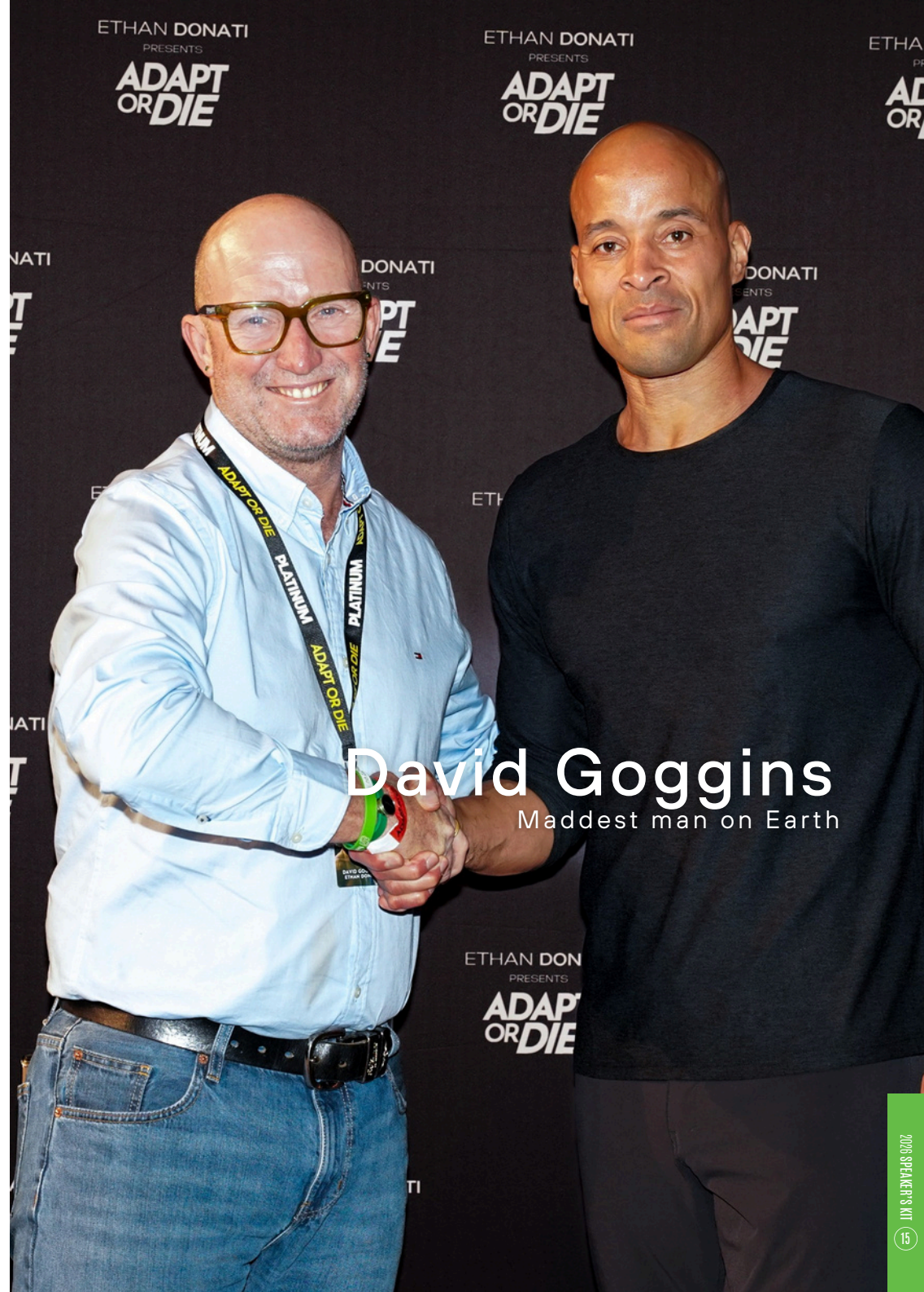
David Goggins Maddest man on Earth