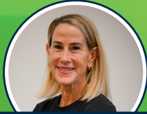
BELINDA GRANGER (AUSTRALIAN TRIATHLETE)